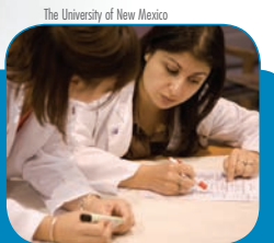
The University of New Mexico