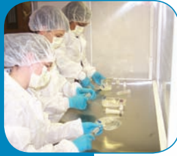
The University of Louisiana at Monroe