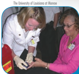
The University of Louisiana at Monroe

Pharmacists provide expertise about the composition of medications, including their chemical, biological and physical properties, as well as their manufacture and use. They ensure drug purity and strength and make sure that medications do not interact in a harmful way. Pharmacists are the medication experts ultimately concerned about their patients' health and wellness.