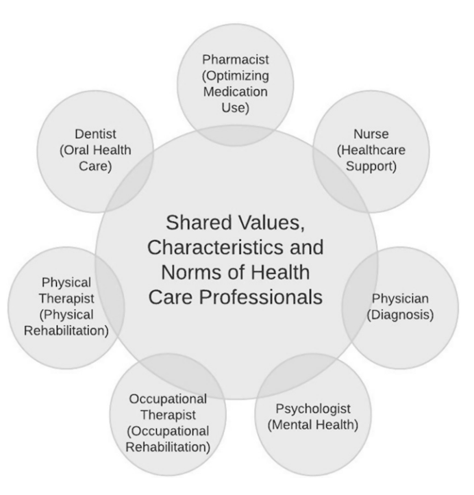
Figure 1. Common and Distinctive Values, Characteristics and Norms of Healthcare Professionals.

should unify pharmacists by focusing on a set of common attributes, values, and norms that contribute to the delivery of high-quality pharmaceutical care, products, and services that are needed to fulfill the Quadruple Aim.<sup>38</sup>