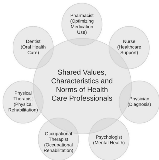
Figure 1. Common and Distinctive Values, Characteristics and Norms of Healthcare Professionals.

should unify pharmacists by focusing on a set of common attributes, values, and norms that contribute to the delivery of high-quality pharmaceutical care, products, and services that are needed to fulfill the Quadruple Aim. 38